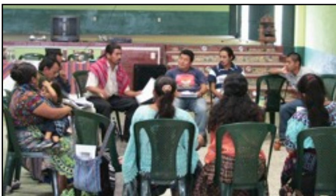
IITC Cultural Indicators workshop, Chimaltenango, Guatemala, June 2008

The Cultural Indicators for Food Sovereignty, Food Security and Sustainable Development were developed by Indigenous Peoples in partnership with the UN Food and Agricultural Organization (FAO) at the 2nd Indigenous Peoples' Global Consultation on the Right to Food and Food Sovereignty in Bilwi Nicaragua (2006). They offer a practical tool for Indigenous communities to assess current strengths, trends and threats, including the traditional cultural practices, knowledge and relationships related to their traditional food systems, and to develop effective strategies to defend, protect and restore their Food Sovereignty. Training workshops on using the Cultural indicators are carried out by IITC in a number of Indigenous communities.